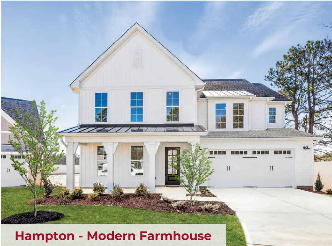
Hampton - Modern Farmhouse