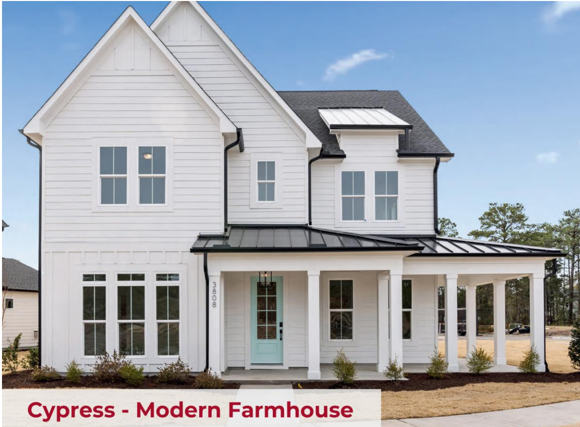
Cypress - Modern Farmhouse